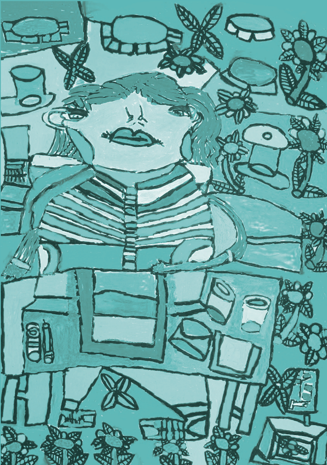
Image Credit: Sinéad Fahey, 'Sinéad at her desk', Acrylic Marker on Paper, 76x57cm, 2014

Callan Workhouse Union is a developing facility and commissioning agency for visual art, design, architecture, research and community activities - with projects examining the future of rural towns, housing, civic infrastructure and the commons.